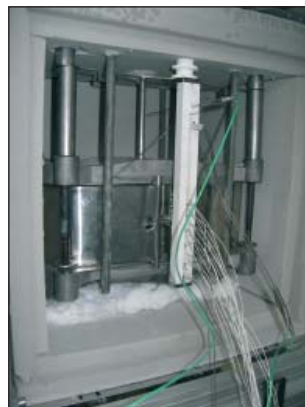
2 kW stack integrated in a demonstration system

Specifications subject tot change without notice